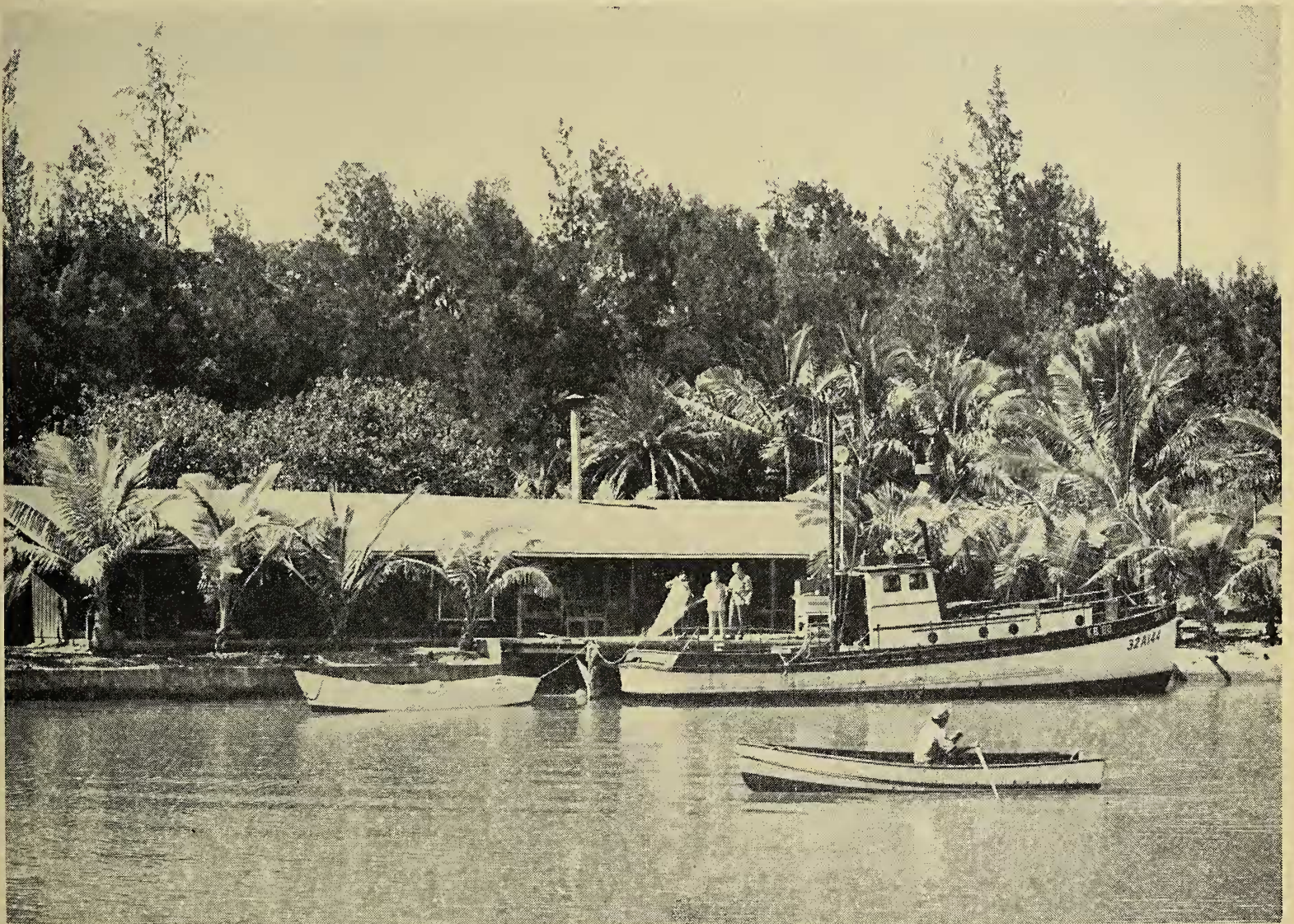
FIG. 4. View of the laboratory building.

Laboratories are supplied with hot and cold running fresh water, 110- to 115-volt alternating current, and bottled-gas outlets. Vacuum and pressure are achieved by portable pump